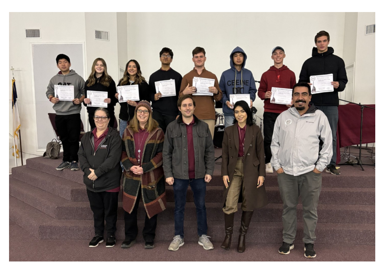
High School Juniors/Seniors at Semester 1 Awards, Jan. 2024